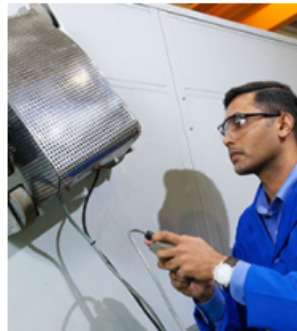
London South Bank Innovation Centre