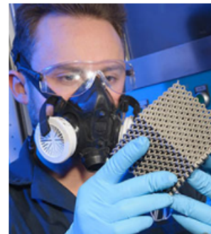
Joining 4.0 Innovation Centre