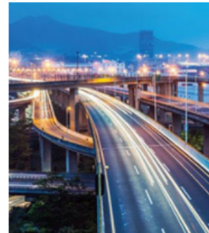
Smart Asset Management Innovation Centre