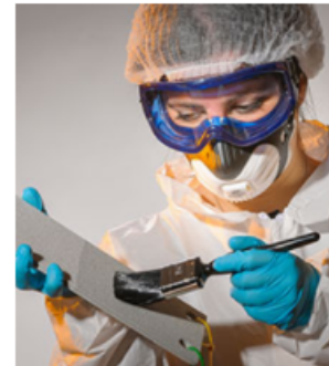
Advanced Resins and Coatings Innovation Centre