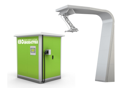
Opportunity charging systems Monitoring Systems 100kW - 700kW