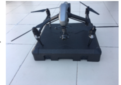
Figure 1: MKLab's Unmanned Aerial Vehicle

Through its involvement in the aforementioned projects, MKLab has built an infrastructure of considerable computational capacity (400+ cores, 600+GB RAM, 100+TB storage) and developed a sophisticated distributed architecture for data collection and indexing, as well as a variety of cutting edge data mining and retrieval algorithms. The team is therefore in excellent position to support a wide range of data collection, mining and indexing needs within research and innovation projects. In addition, MKLab has an Unmanned Aerial Vehicle (UAV) model DJI Inspire 2+Zenmuse X4S with Quadcopter and Gimbal Camera and the following characteristics: Max. Flight time: 27 min, Max. Trans. Distance: 7 km, Operable in low-GPS signal environments, External camera: 4K 60 fps. The UAV of MKLab is shown in Figure 1 and can support all aqua3S pilots.