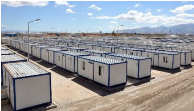
Malatya Container Camp