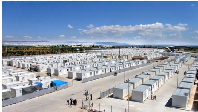
Kahramanmaraş Container Camp